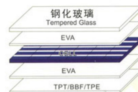
FIGURE OF STRUCTURE